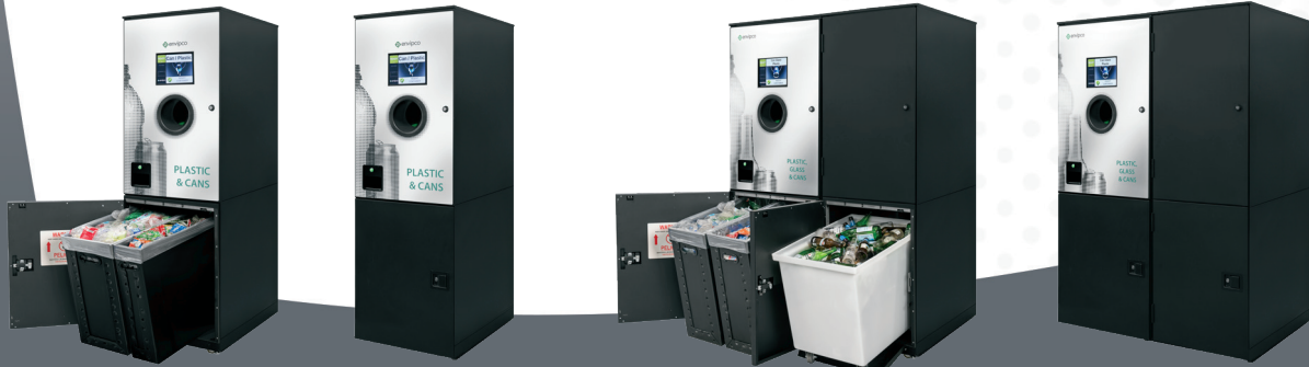
PLASTIC & CANS