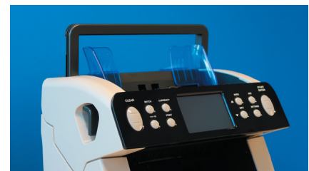
Integrated carrying handle.