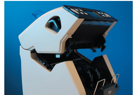
Pull the handle to open the top. Easy access for cleaning and maintenance.